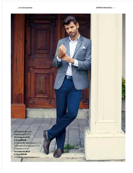
„viviamente“ DEPRATI MAGAZINE • Chaqueta de vestir Expressione 35000 • Pantalón de 3241 • P. Final 35130 • Camisa RL. Expressione 33500 • Pantalón Expressione 33500 • Zapatos 35000 • Cinturón de 36467 • P. Final 359136 • Cinturón Expressione 35000