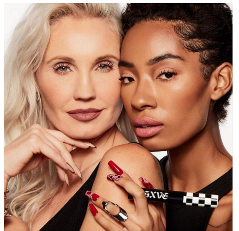
WIGGLE BRUSH FROM ROOT TO TIP TO LENGTHEN, LIFT, & SEPARATE.