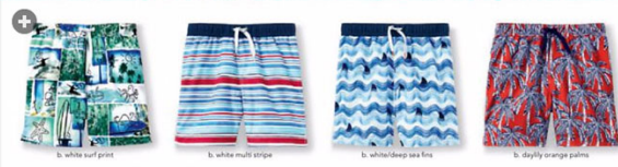
b. white surf print b. white multi-stripe b. white/teal sea life b. joyfly orange palms