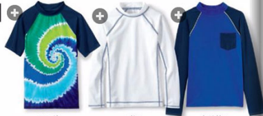
navy swirl colorblock graphic rash guard, $25, 476706-P52