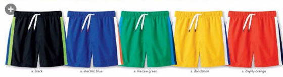
a. black a. electric blue a. ocean green a. dandelion a. dayfly orange

Get this look: Painted Stripe Bath Guard, design as pictured (top), 478753-PS8, g. 4); Volley Printed Bath Ring, white multi-stripe, all styles imported, landsend.com