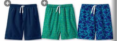
navy seas solid swim trunks, $19.50, 476820-P57