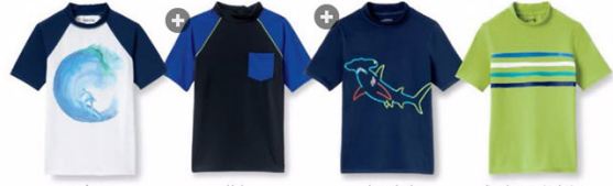
surfer colorblock graphic rash guard, $25, 476708-P52