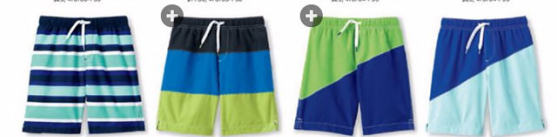
sea spray stripes printed swim trunk, $25, 476705-P52