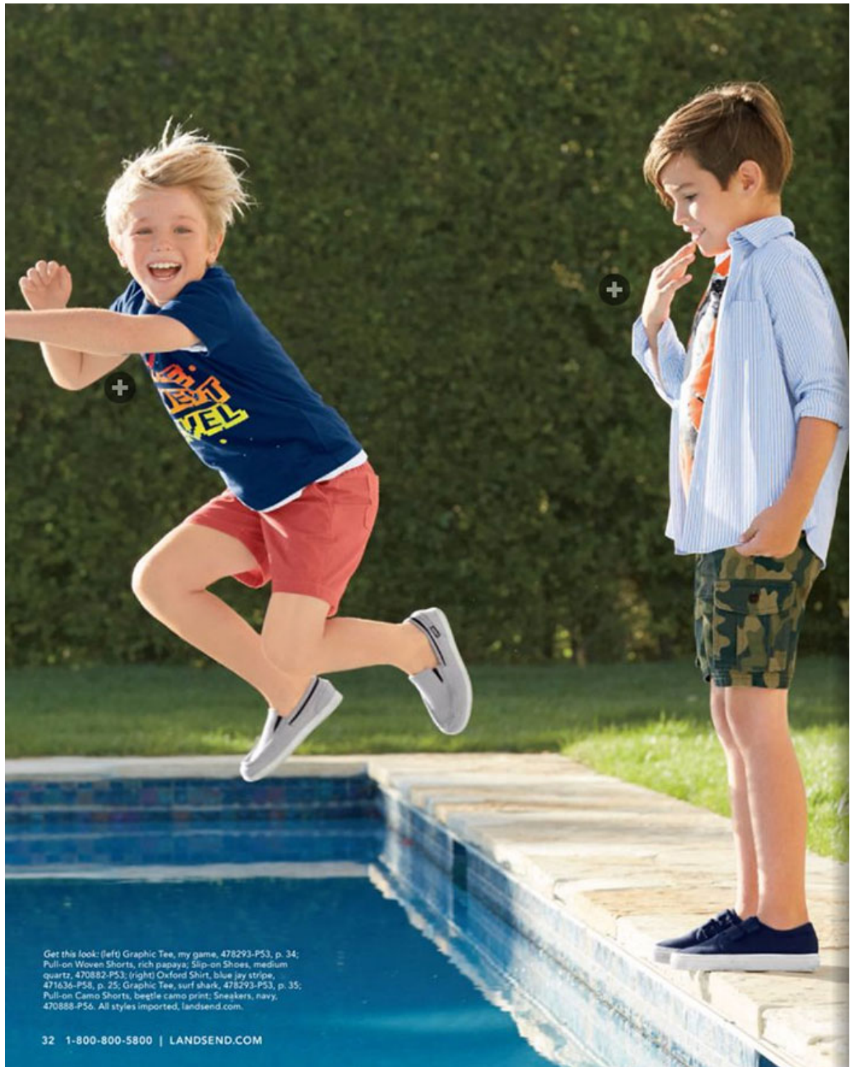
Get this look: (left) Graphic Tee, my game, 478293-PS3, p. 34; Pull-on Woven Shorts, rich papaya; Slip-on Shoes, medium quartz, 470882-PS3; (right) Oxford Shirt, blue jay stripe, 471636-PS8, p. 25; Graphic Tee, surf shark, 478293-PS3, p. 35; Pull-on Camo Shorts, beetle camo print; Sneakers, navy, 470888-PS6. All styles imported, landsend.com .