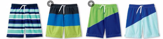
sea spray stripes printed swim trunks, $25, 476705-P52