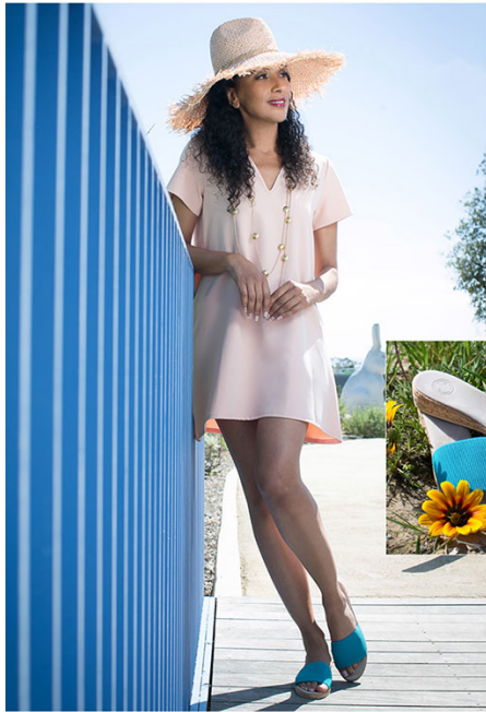
Charleston Shoe Co. Sandbar slide sandal Novecento Boutique Blush A-line dress Winston's Crown Jewelers 18 karat yellow gold harem-style necklace