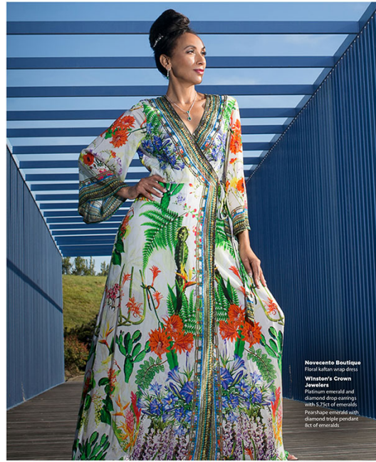
Novecento Boutique Floral kaftan wrap dress Winston's Crown Jewelers Platinum emerald and diamond drop earrings with 5.2ct of emeralds Pearshape emerald with diamond triple pendant 6ct of emeralds