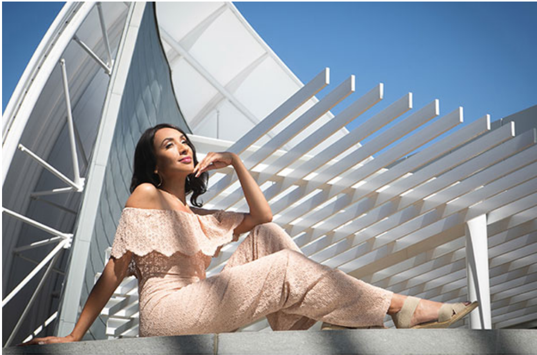
Charleston Shoe Co. Carmen's sandals in brown. Movements Boutique Buckle watch face off the shoulder pendant. Watson's Crown Jewellers 18 karat yellow gold multi-gem diamond brooch 1.75ct.