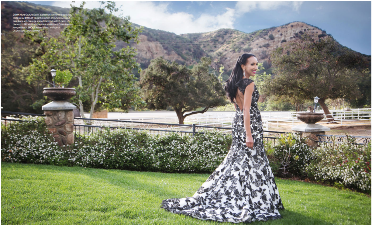
GOWN Alure Couture Gown, available at Mon Amie Bridal Salon, Costa Mesa. JEWELRY Elegant collection of round princess-cut pear shape and marquise shaped earrings with 5 carats of diamond in set and 10.00 ct. available at Winston Crown Jewelers, Newport Beach. SHOES "Nirres" pumps, available at On the Style, Newport Beach.