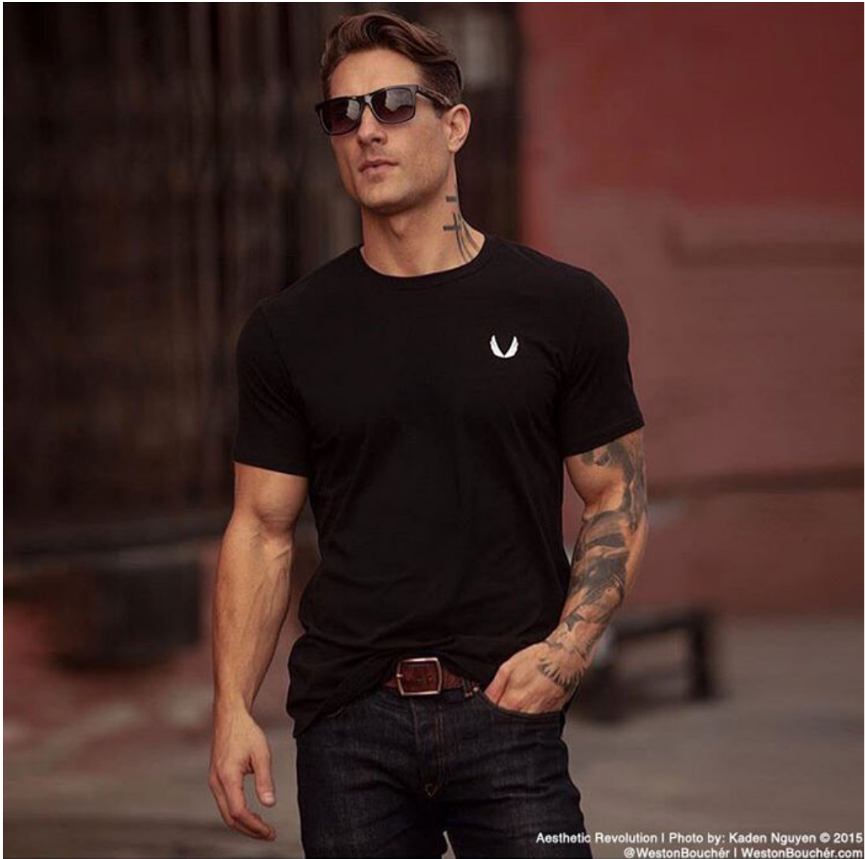
Aesthetic Revolution