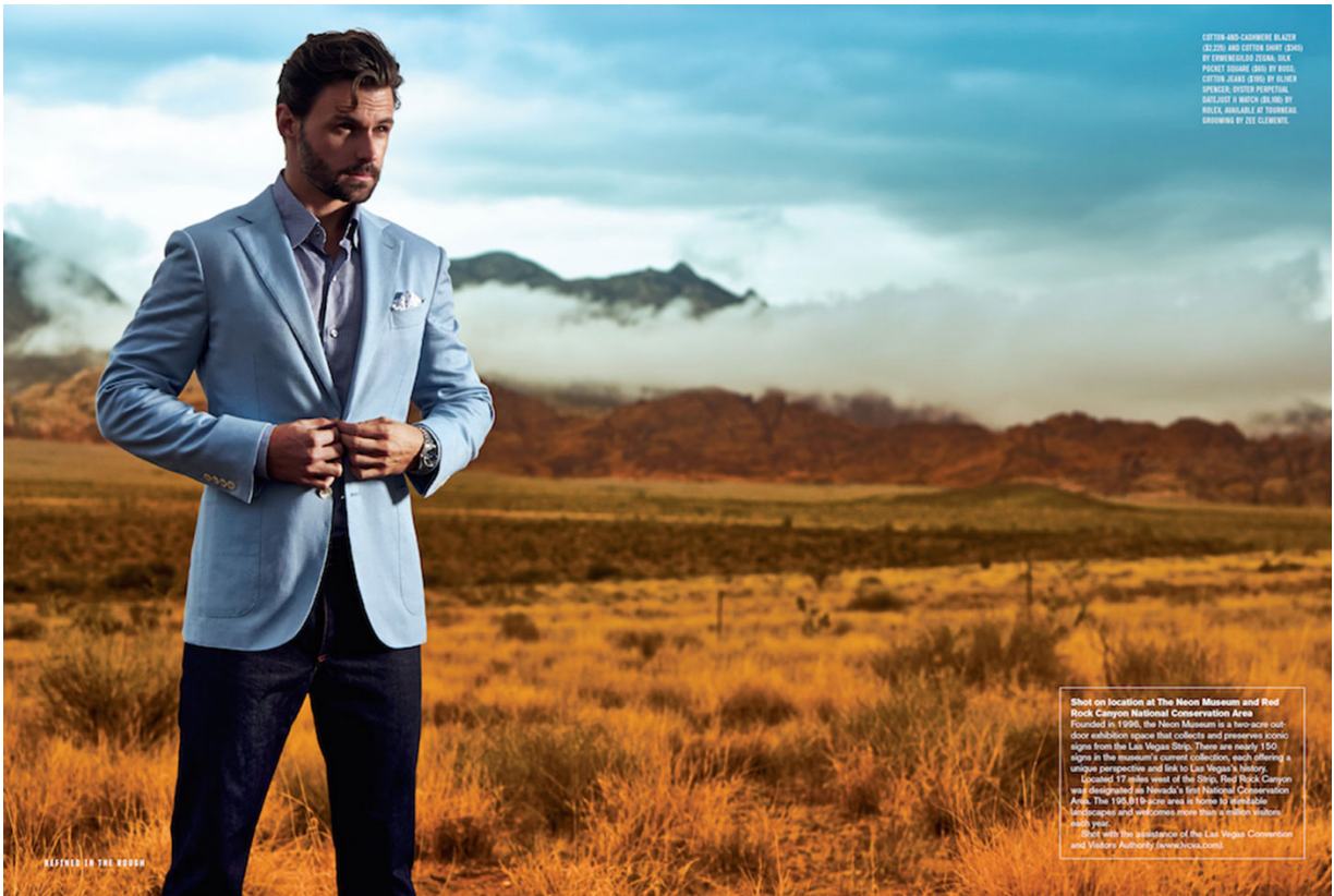
CUTTER-AND-CASHMERE BLAZER $2,200 AND CUTTER-AND-CASHMERE SHIRT $200 BY FERRAGAMO DESIGN, USA POCKET SQUARE $60 BY BRUNO MAGLI, ITALY, $120 BY FILIPPO SPENGLER, SWITZERLAND, $100 BELLAZZI & BIRCH (SHIRT) BY BOLE, AVAILABLE AT THORNBURG BROWNING BY JEE CLEMENT