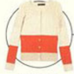
Cardigan, The Limited , $49.90.