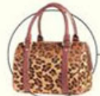
Bag, Bakers , $52.