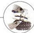
From the top: Wave bangles, Express , $16.90. Spike bangle, Forever 21 , $4.80. Bracelet, Banana Republic , $55.

A RELAXED PANT SHOULDN'T BE TOO BAGGY. MAKE SURE IT STILL FLATTERS YOUR BODY SHAPE.