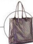
Bag, J.Jill , $139.