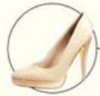
Pumps, Aldo , $75.