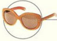
Sunglasses, Marc Jacobs , $325. Available at Solstice .