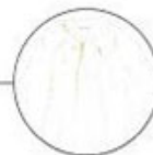
Peasant blouse, Lucky Brand , $99.