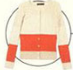
Cardigan, The Limited , $49.90.