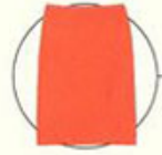
Skirt, The Limited , $59.90.