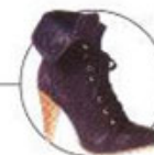
Booties, Steve Madden , $169.

↑ ANOTHER LOOK FOR THE PANT: ADD A SPARKLY TWEED AND A WEAVER-HIGH RED PLATFORM FOR EVENING.