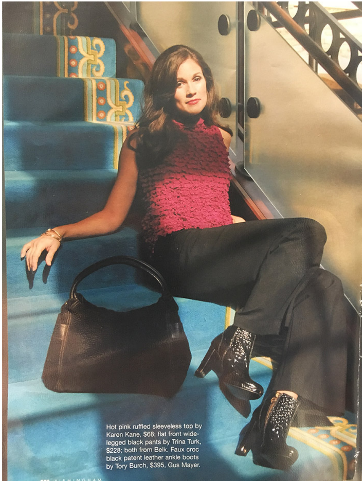
Hot pink ruffled sleeveless top by Karen Kane, $68; flat front wide-legged black pants by Trina Turk, $228; both from Belk. Faux croc black patent leather ankle boots by Tory Burch, $395, Gus Mayer.