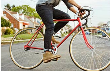
SKINNY JEAN | STYLE No. 3060