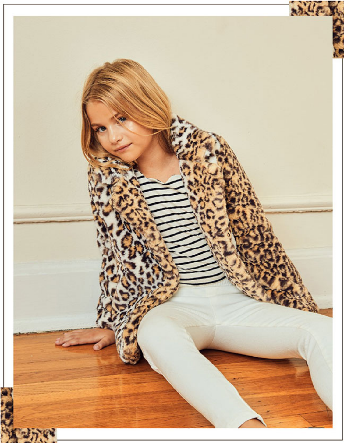
Stripe Scallop Neck Top | High-Rise Stretch Skinny Jeans