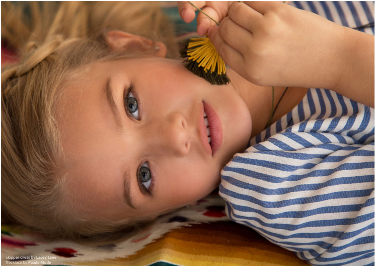
Skipper dress by Lacey Lane Necklace by Paade Mode