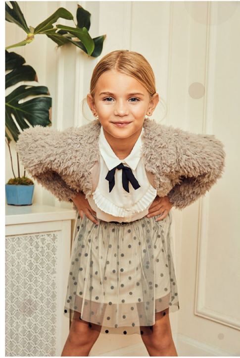
Lightweight Faux Fur Jacket | Pleated Button-Down Front-Tie Top | Polka-Dot Tulle Mini Skirt