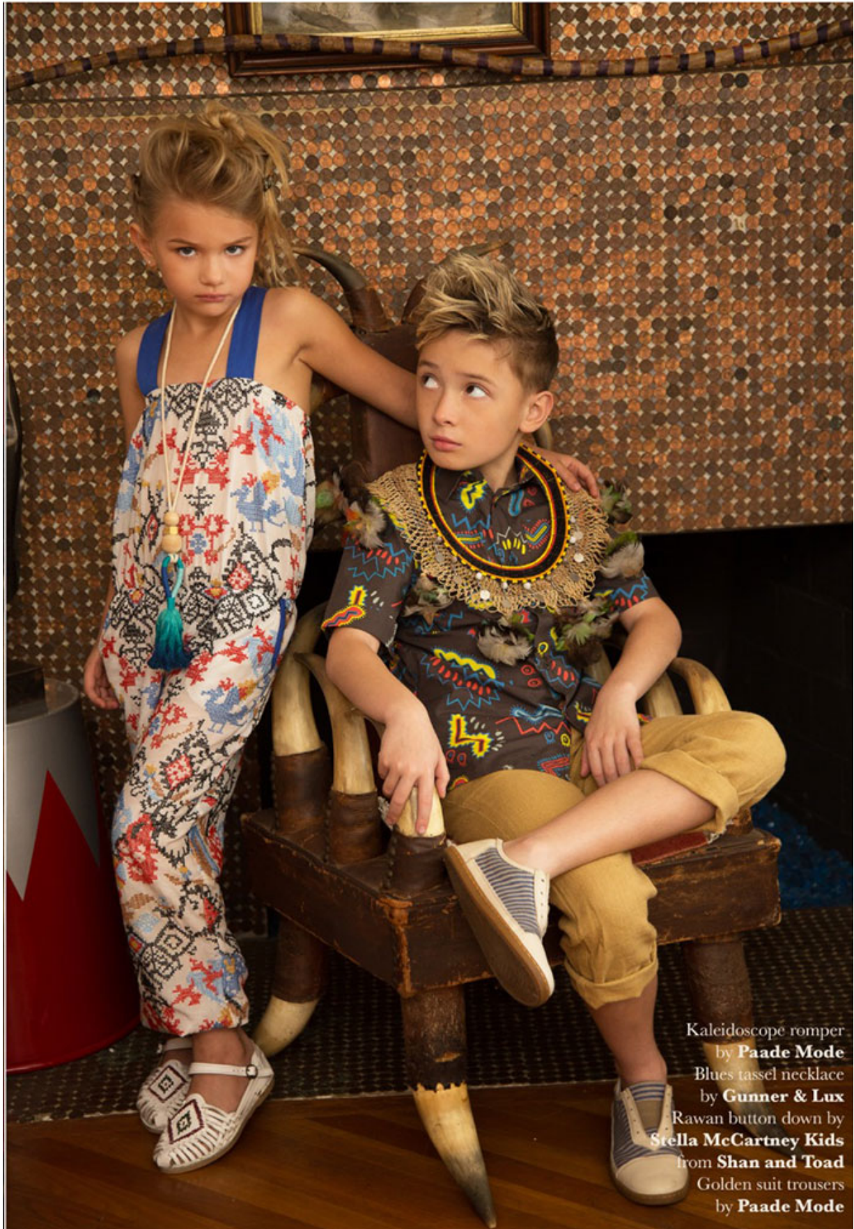
Kaleidoscope romper by Paade Mode Blues tassel necklace by Gunner & Lux Rawan button down by Stella McCartney Kids from Shan and Toad Golden suit trousers by Paade Mode