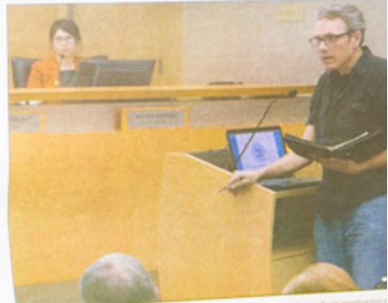
Speak your mind... CollegeTown residents express their concerns about the CollegeTown construction...