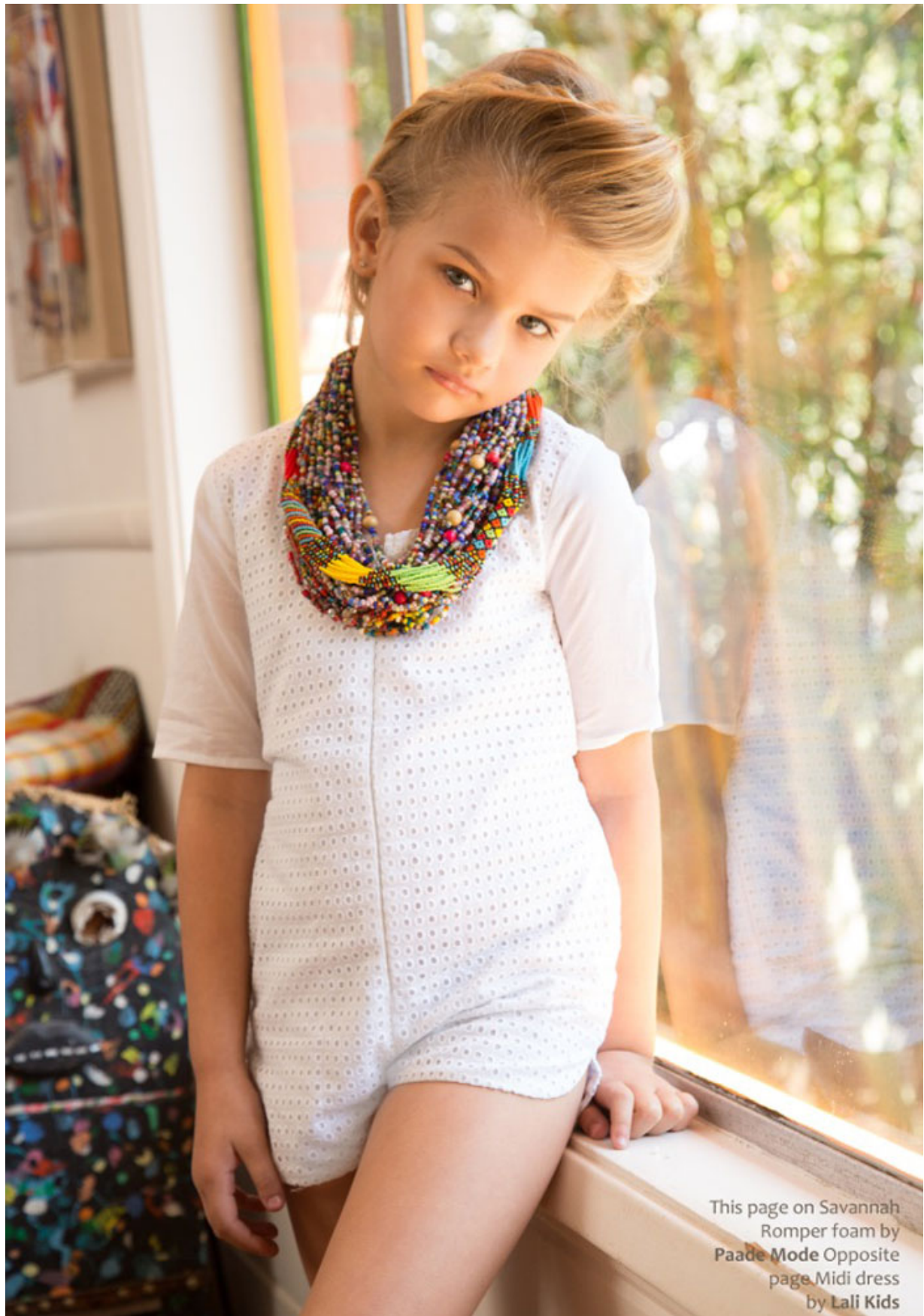
This page on Savannah Romper foam by Paade Mode Opposite page.Midi dress by Lali Kids